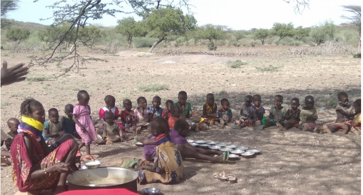
Feeding of the children of one of the four nurseries in Kaaleng, Turkana (Kenya)